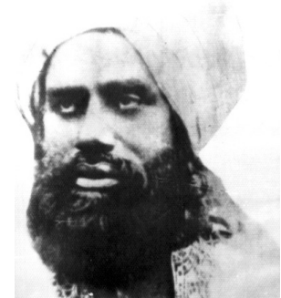
Hazrat Maulana Hakeem Nur ud Deen, the First Successor of Hazrat Mirza Ghulam Ahmad Sahib of Qadian