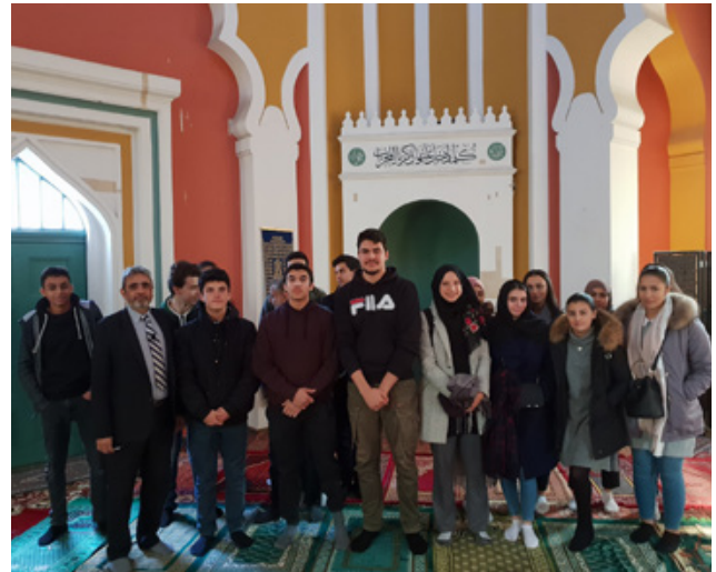
Various groups who visited the Berlin Mosque