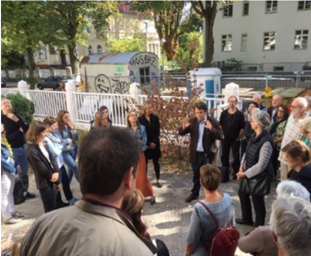
A member of the Architect D4 explaining details of the renovation work done.