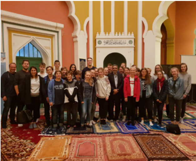
Various groups who visited the Berlin Mosque