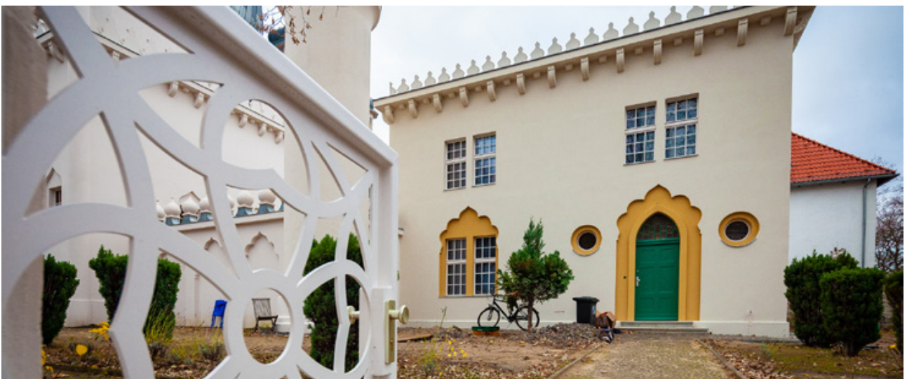
A view of the front of Imam's House at the Berlin Mosque. December 2018 issue of Hope will be devoted to the images of completion of renovations at the Berlin Mosque and the Imam's House.