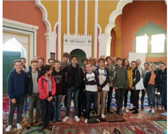
Various groups who visited the Berlin Mosque