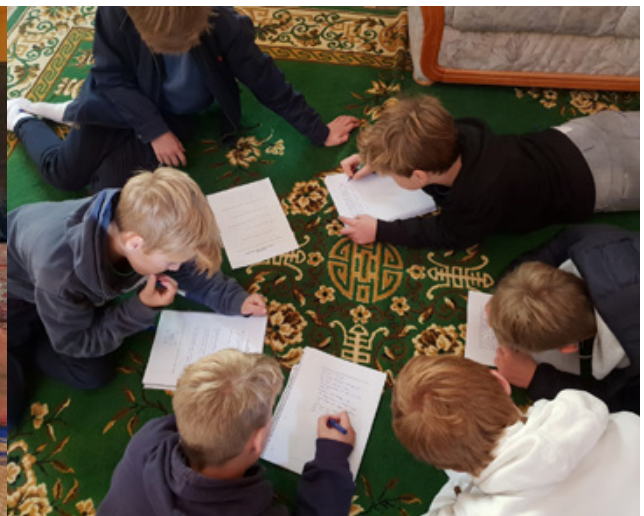
Students from a school completing their assignment about the Berlin Mosque.