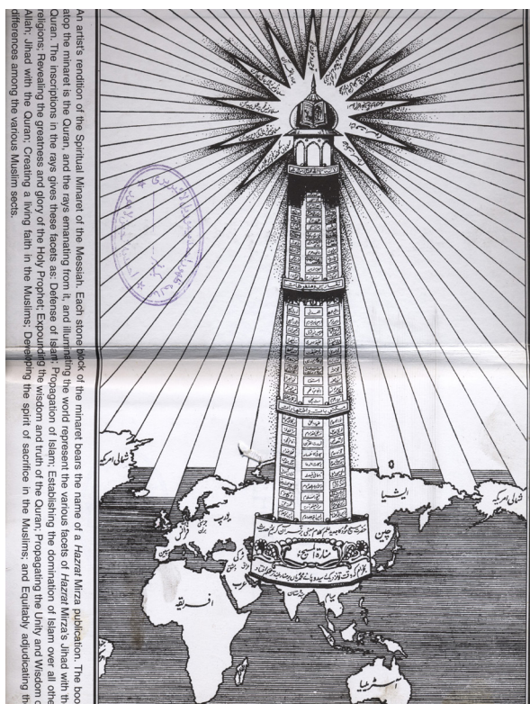
An artist's rendition of the Spiritual Minaret of the Messiah. Each stone block of the minaret bears the name of a Hazrat Mirza publication. The book atop the minaret is the Quran, and the rays emanating from it, and illuminating the world represent the various facets of Hazrat Mirza's Jihad with the Quran. The inscriptions in the rays give these facets as: Defense of Islam; Propagation of Islam; Establishing the domination of Islam over all other religions; Revealing the greatness and glory of the Holy Prophet; Expounding the wisdom and truth of the Quran; Propagating the Unity and Wisdom of Allah; Jihad with the Quran; Creating a living rain in the Muslims; Developing the spirit of sacrifice in the Muslims; and Equitably adjudicating the differences among the various Muslim sects.

“Doing missionary work is an expression of the determination to preach one’s own religion to people who do not share it with a view to change their beliefs. The concept of a mission is rooted in the Christian and not the Islamic tradition. Accordingly, around 1900, which is the point of departure of this study, Christian missionaries were roaming around the colonial world trying ‘to conquer the world for Christianity’. Mirza Ghulam Ahmad’s vision that the colonized people should beat the Christian missionaries at their own game, so to speak, was in fact a response to that objective. He urged them to embrace religious progress, copy the Christian missionary structures and go out into the world to spread their own message. The drawing symbolizes that vision.